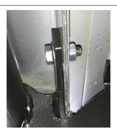
Step 9. Next, tighten the remaining hardware that attaches the bracket to the upper body mount.

Step 8. First, tighten all the hardware that attaches the bracket to the pinch weld of the vehicle.