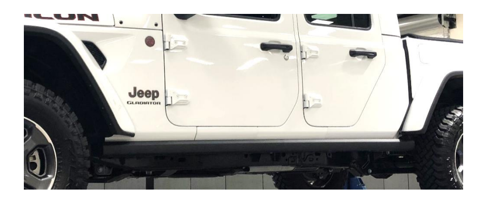
Step 2. Remove the factory running boards and discard.