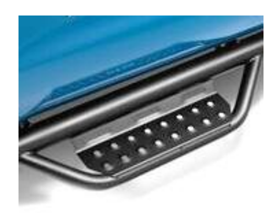
Step 1 . Identify the driver side step.