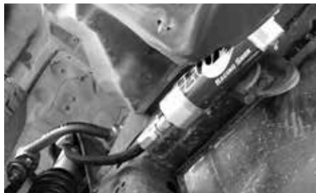
Fig. 4: Passenger side