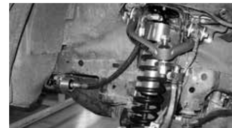
Fig. 2: Driver side

and towards the front of the vehicle (Fig. 2). Connect the top shock hat to the vehicle using the bolts and washers provided or with Performance Series models connect the top shock hat to the vehicle using the nuts provided. Tighten all three bolts or nuts to 24 ft* lbs.