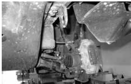
Fig. 3: Driver side