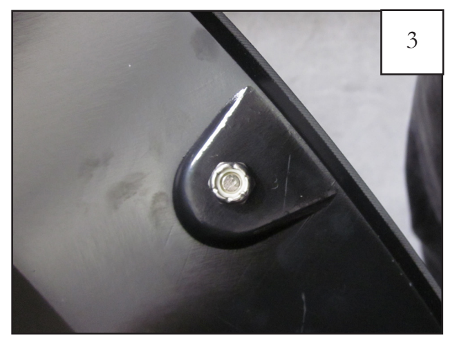
Place a Nut (NU1-0019) over the end of each Bolt and tighten, using a 1/2" wrench for the Nut and the supplied Torx Bit (SW1-0052) for the Bolt. Repeat for remaining pockets.