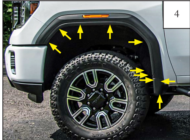
Remove (10) factory installed T-15 Torx screws. Retain screws as these will be reused to install the new flare.