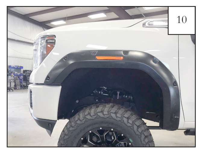
Completed front flare installation.