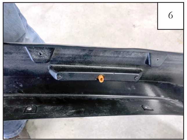
Install light in new flare using (2) torx screws removed in Step 5 .