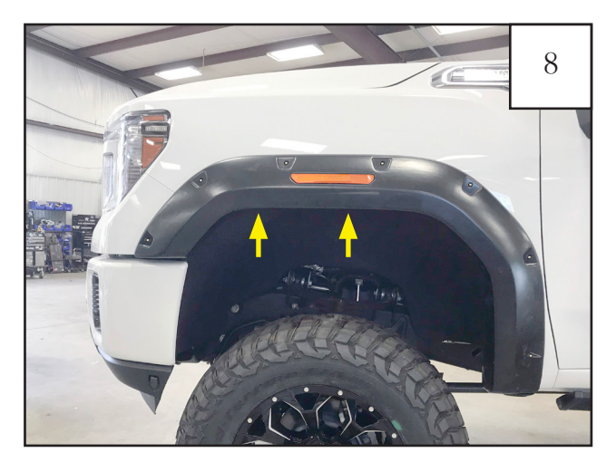
Install (2) Lever Clips (122450) using (2) T-15 torx screws as shown. See Frame 9 for detail.