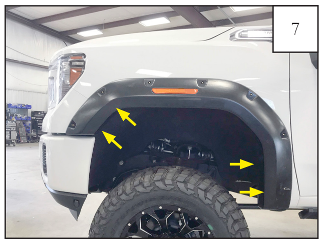
Connect light, and install fender flare reusing (4) T-15 torx screws removed in Step 4 .

Pull back inner fender liner to access (2) factory installed T-15 torx screws that hold the light in place. Remove and retain torx screws. Disconnect light and set aside for reuse. Remove factory fender flare from vehicle.