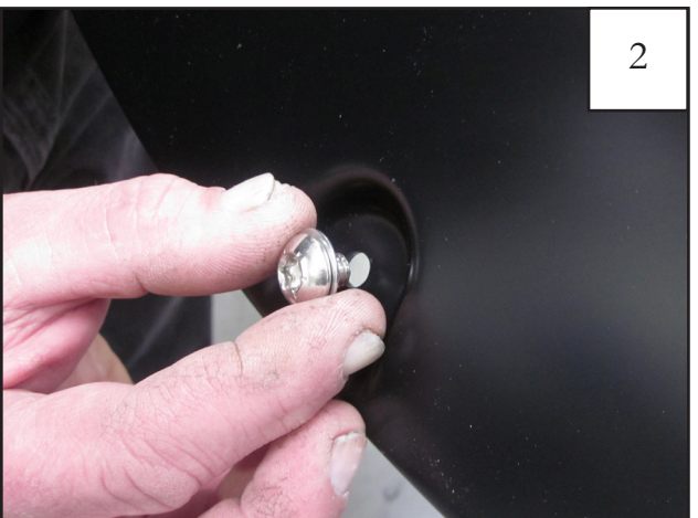
Put each Bolt/Washer combination through a pocket hole in the flare, Bolt head and Washer on the outside.