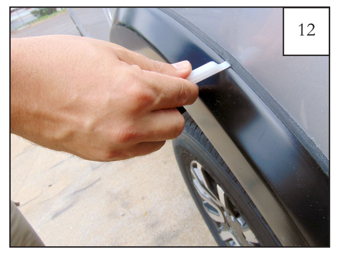
Using flat end of supplied Edge Trim Tool (ET1-0002), seat edge trim against flare by inserting straight end between edge trim and flare at one end. Next, slide around entire edge to the other end.