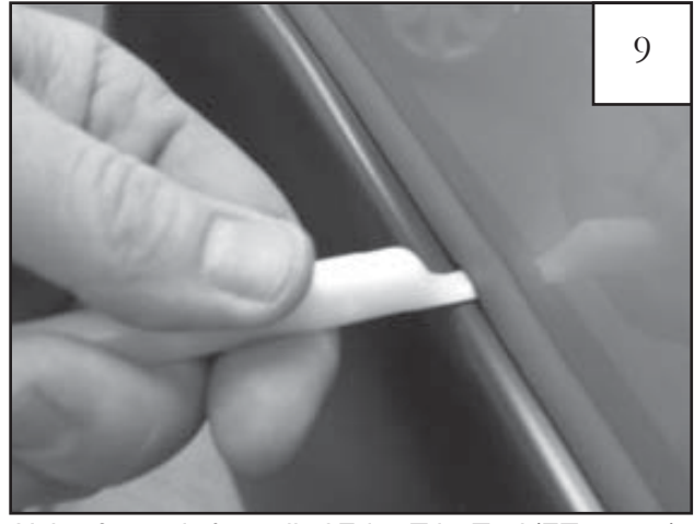
Using flat end of supplied Edge Trim Tool (ET1-0002), seat edge trim against flare by inserting straight end between edge trim and flare at one end. Next, slide around entire edge to the other end.