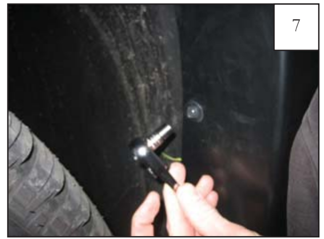
Holding flare in position on fender, reinstall factory screws removed in Step 4.