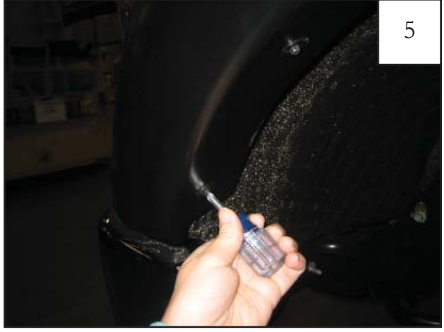
Using a #2 Phillips Screwdriver, install two supplied Tufloks (RV1-P001) through additional holes in flare and into fender. NOTE: Use a push-twist motion.