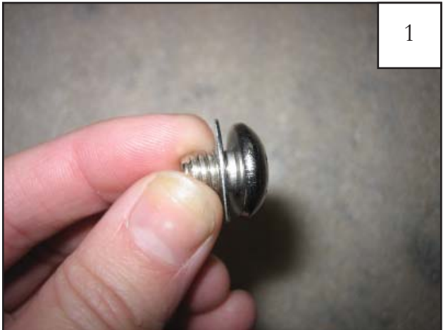
Put a Washer (WA1-0012) on each Bolt (SW1-0059).