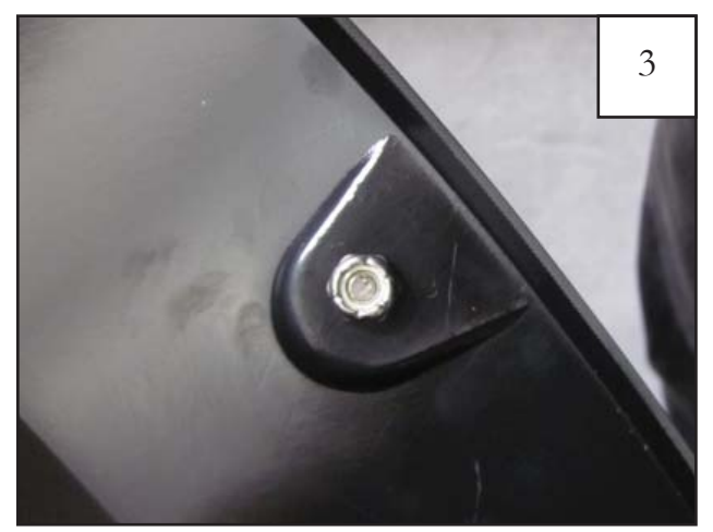
Place a Nut (NU1-0019) over the end of each Bolt and tighten, using a 1/2" wrench for the Nut and the supplied Torx Bit (SW1-0052) for the Bolt. Repeat for remaining pockets.