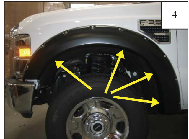
Remove four factory screws with a 7/32" socket wrench. Save screws for reinstallation.