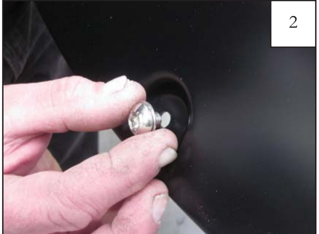
Put each Bolt/Washer combination through a pocket hole in the flare, Bolt head and Washer on the outside.