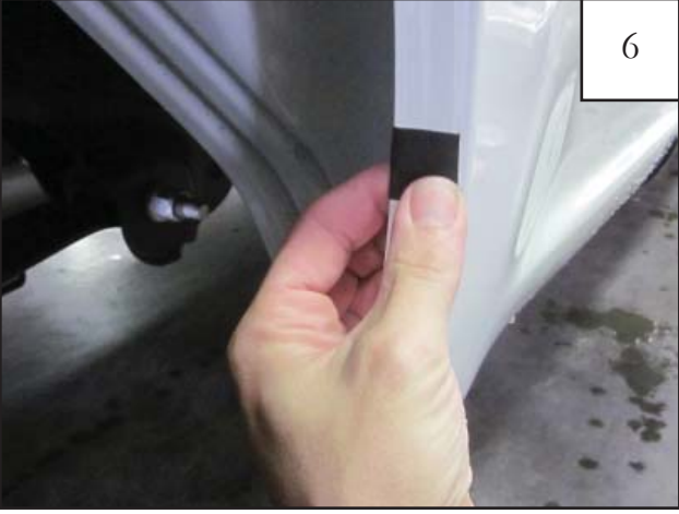
Wrap a Foam Tab (MT1-0034) around the wheel well sheet metal, centered over each of the upper four marks made in Step 15. Place a Mylar Tab (MT1-0014) at the mark made on the lower front of the wheel well.