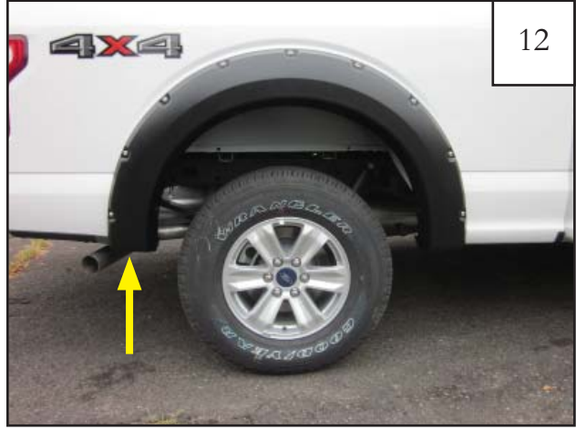
Install supplied push retainer (RV1-P0006) into flare and through factory hole at rear of wheel well.