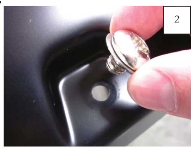
Put each Bolt/Washer combination through a pocket hole in the flare, Bolt head and Washer on the outside.