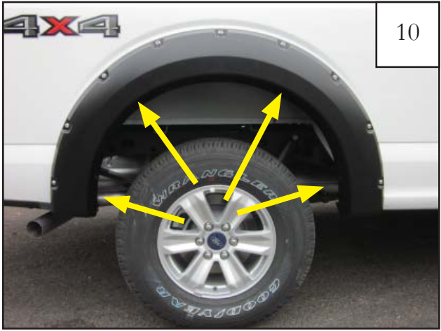
While holding flare to vehicle, start supplied screws (SW1-0058) through the four topmost mounting holes in flare and into the clips installed in Step 18.