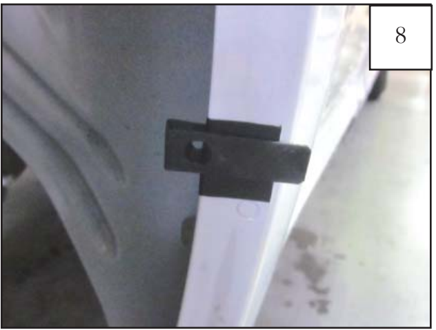
Install a Clip (CL1-0009) over each of the four Tabs (MT1-0034) placed over the upper 4 marks made in Step 16.