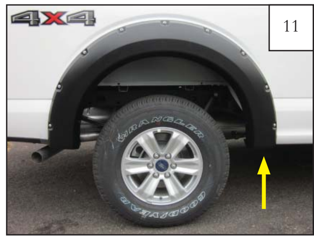
Start a supplied screw (SW1-0050) through the flare into the clip installed in Step19. Tighten all screws.