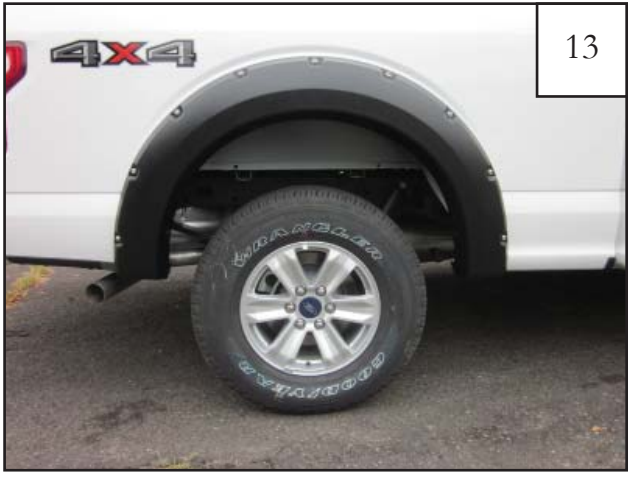
Completed rear flare installation.