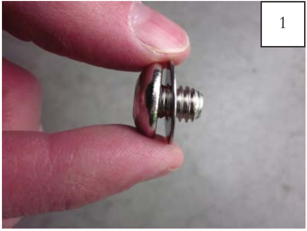
Put a Washer (WA1-0012) on each Bolt (SW1-0067).