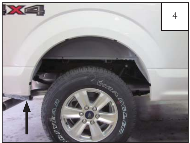
Remove factory fastener from rear of wheel well. Thoroughly clean the vehicle sheet metal and inner flange prior to installation.