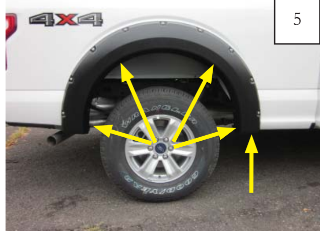
Hold flare to vehicle and mark five flare hole locations with a grease pencil.