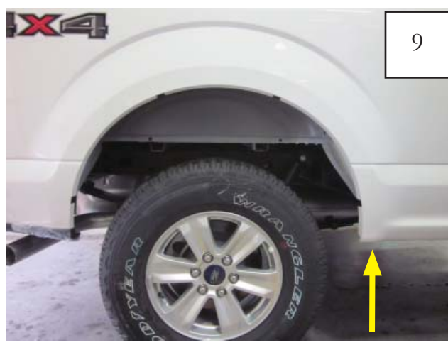
Install a supplied "S" clip (CL1-0005) over the mylar tab installed at the lower front of the rear wheel well.