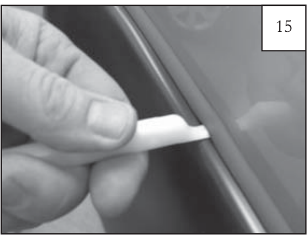
Using flat end of supplied Edge Trim Tool (ET1-0002), seat edge trim against flare by inserting straight end between edge trim and flare at one end. Next, slide around entire edge to the other end.