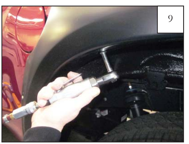
Ensure flare is properly positioned and tighten all screws.