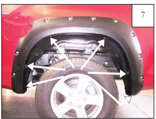
Hold flare firmly on the fender. Start a supplied Screw (SW1-0036) through each hole in flare and into hole in fender. (6 locations)