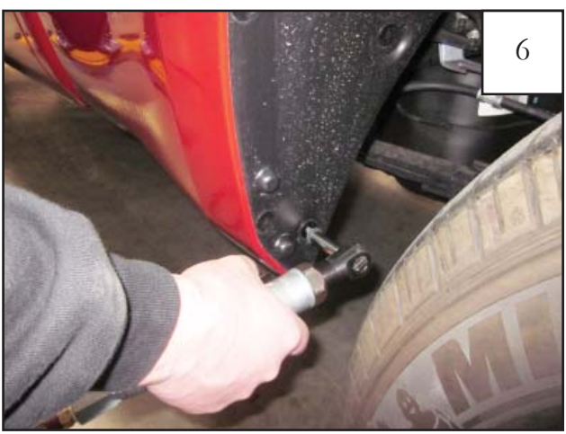
Using a socket wrench with a 10mm socket, remove lower screw from front of rear wheel well as shown.