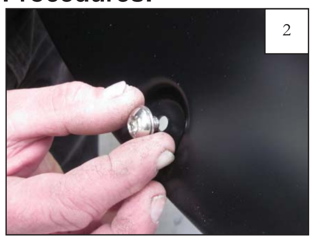
Put each Bolt through a pocket hole in the flare, bolt head on the outside.