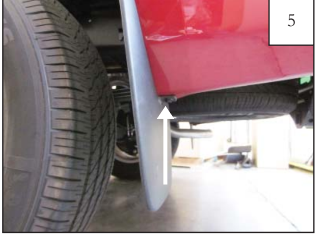
Remove one hex bolt from underside of mud flap using a 10mm socket. Discard mud flap.