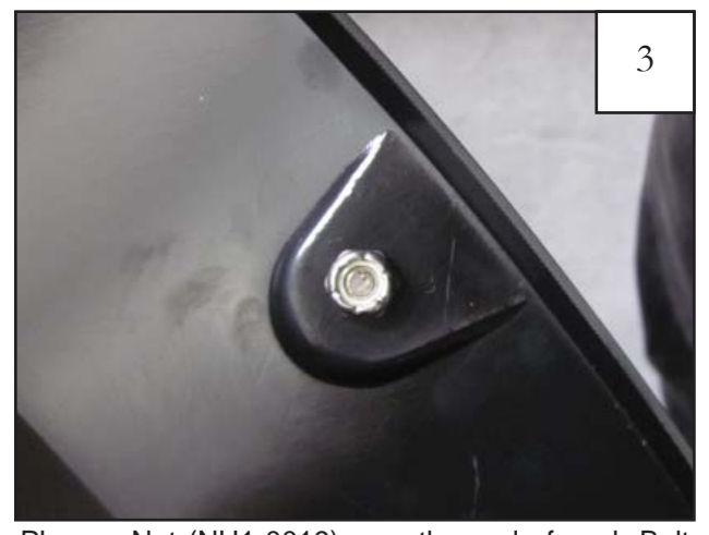
Place a Nut (NU1-0019) over the end of each Bolt and tighten, using a 1/2" wrench for the Nut and the supplied Torx Bit (SW1-0052) for the Bolt. Repeat for remaining pockets.