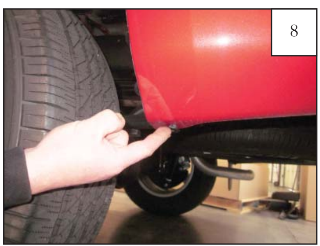
NOTE: If the lower rear wheel well does not contain a plastic grommet, insert supplied Grommet (GR1-0001) into the factory hole as shown.