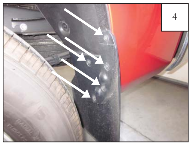
Remove five hex bolts from factory mud flap using a 10mm socket.