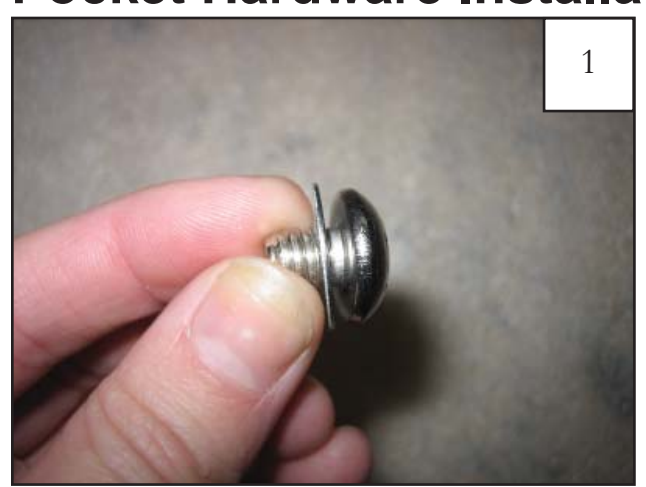
Put a Washer (WA1-0012) on each Bolt (SW1-0059).