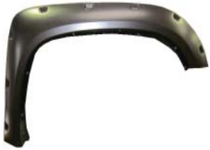
Driver Side x1