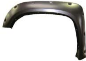
Passenger Side x1