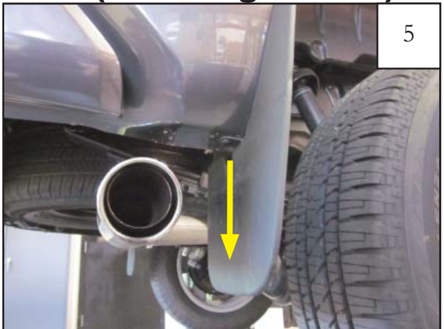
Remove push retainer from underside of factory mud guard and remove mud flap.