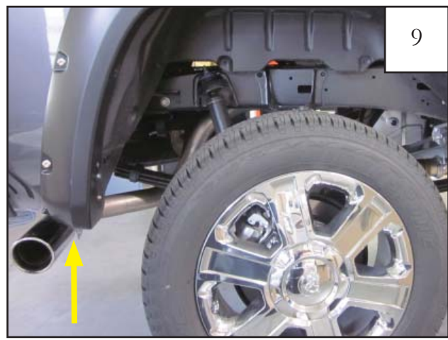
Install supplied Push Retainer (RV1-P009) into factory hole on underside of flare.