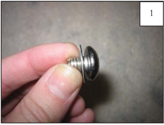
Put a Washer (WA1-0012) on each Bolt (SW1-0059).