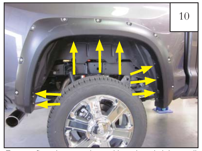
Ensure flare is properly positioned and tighten all screws. (See steps 6-8). Installation Complete