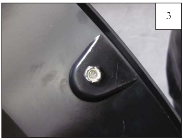
Place a Nut (NU1-0019) over the end of each Bolt and tighten, using a 1/2" wrench for the Nut and the supplied Torx Bit (SW1-0052) for the Bolt. Repeat for remaining pockets.