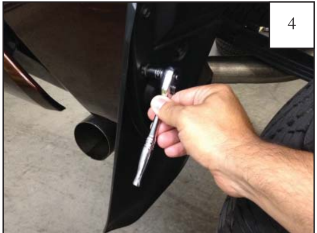
Using a socket wrench with a 10mm socket, factory screw second from the top of the mud guard.