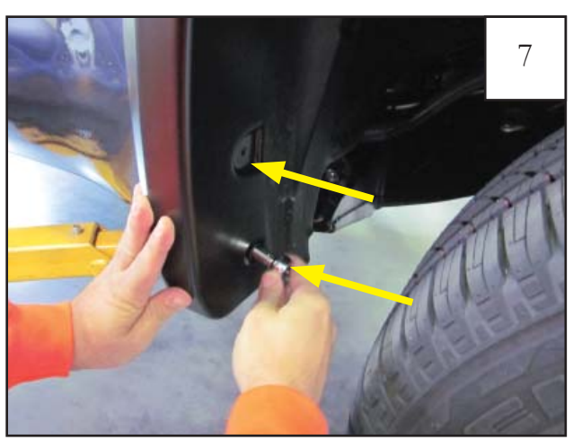
Start two supplied 20mm Hex Screws (SW1-0036) through the rearward most holes of flare and into the factory hole in fender.