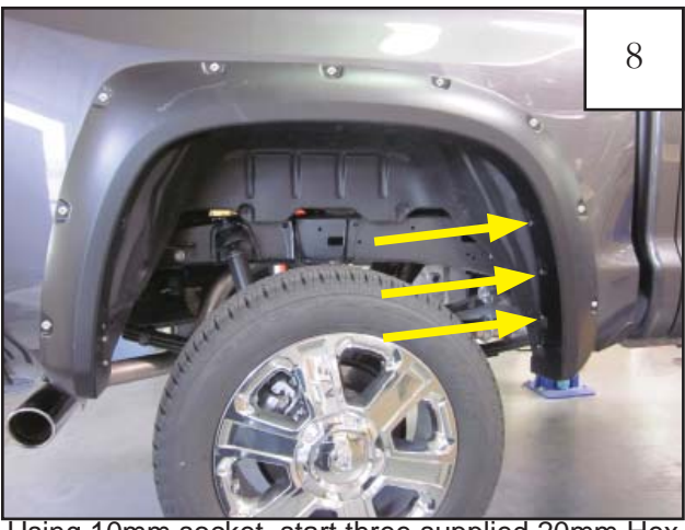
Using 10mm socket, start three supplied 20mm Hex Screws (SW1-0036)through the forward most holes of flare and into factory holes in fender.