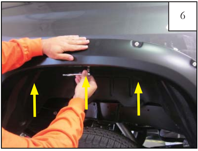
Hold the flare firmly on the fender. Start three supplied 20mm Hex Screws (SW1-0036) through the top center holes of the flare and into factory holes in fender.