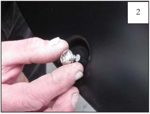
Put each Bolt/Washer combination through a pocket hole in the flare, Bolt head and Washer on the outside.