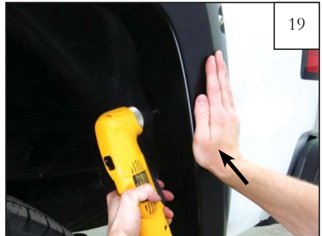
Install self-tapping screws (SW1-0015) into pilot holes drilled in step 36 (3 places). Press flare firmly towards the vehicle while fully tightening.