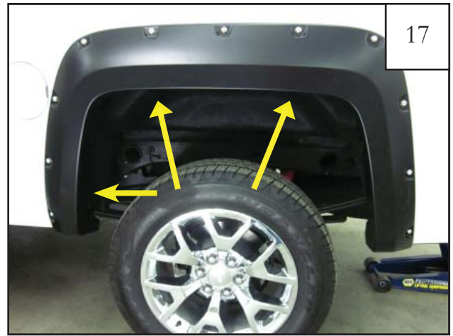
While holding flare on vehicle, install supplied screws (SW1-0056) into the 2 upper and 1 lower factory hole locations. Do not fully tighten at this time.