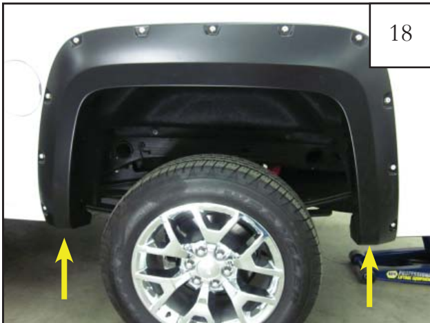
Reinstall the lower 2 factory fasteners removed in step 27 using a 10mm deep socket and wrench.