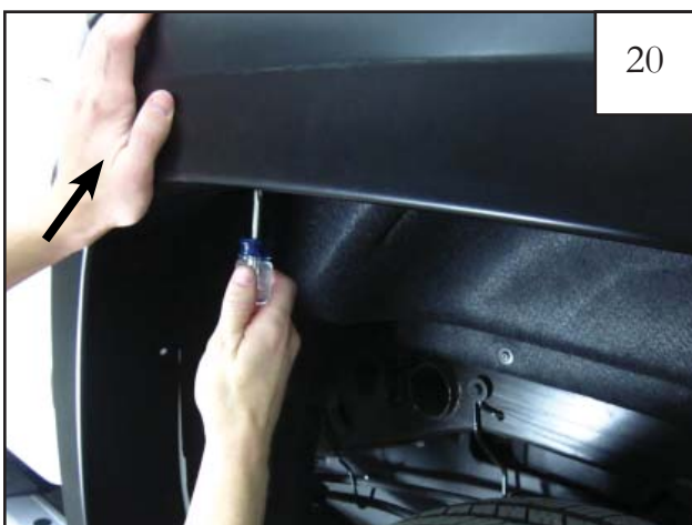
Press flare towards vehicle and fully tighten all remaining fasteners.