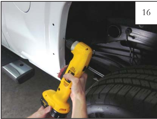
Using a 3/32" drill bit, drill pilot holes through sheet metal at the marks made in Step 34.