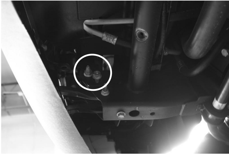
Figure 3 - STUD PLATE NUT LOCATION

Chevy Vengeance Bumper Product Number: D2051-D2052 Application: '07-'12 CHEVY 1500