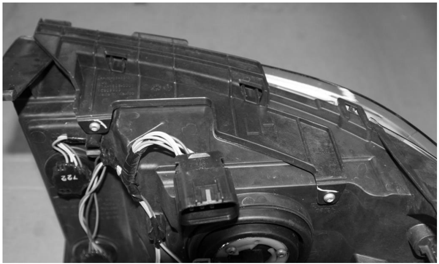
Figure 6 - TORX LOCATION