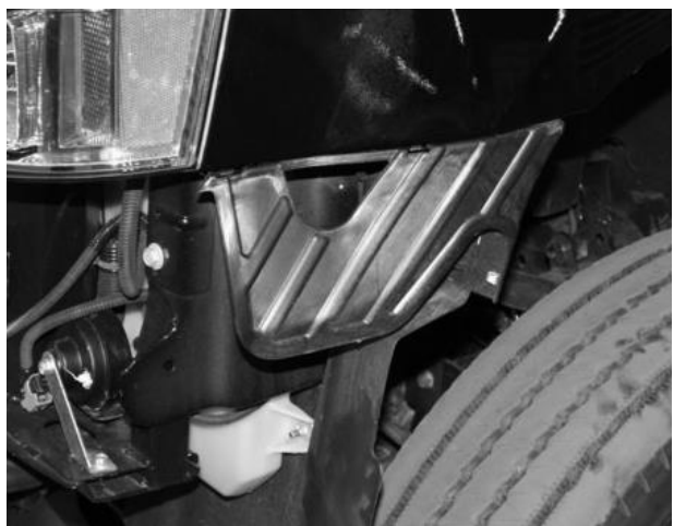
Figure 5 - SUPPORT STRUCTURE LOCATION

10. Remove the two plastic brackets at the front of each fender by removing the two dart clips from the wheel well and the three 10mm bolts. See Image Below