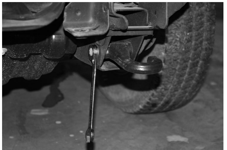
Figure 4 - TOW HOOK