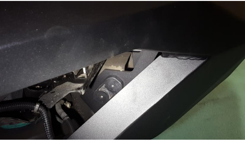
Figure 7 – Stud Plate Orientation

Chevy Vengeance Bumper Product Number: D2051-D2052 Application: '07-'12 CHEVY 1500