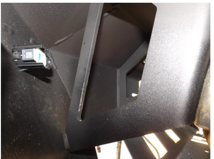
Figure 9B Outer DS Sensor

L. After assuring sensors work in current orientation, epoxy should be applied to the housing on inside of bumper and allowed to dry.