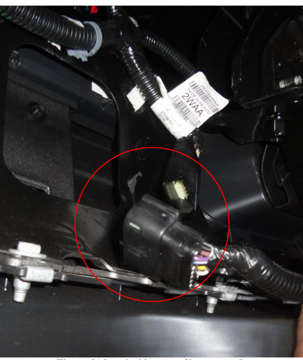
Figure 3(electrical harness disconnected)

Product Number: D3051, D3052 Application: 2014-2015 Chevy 1500