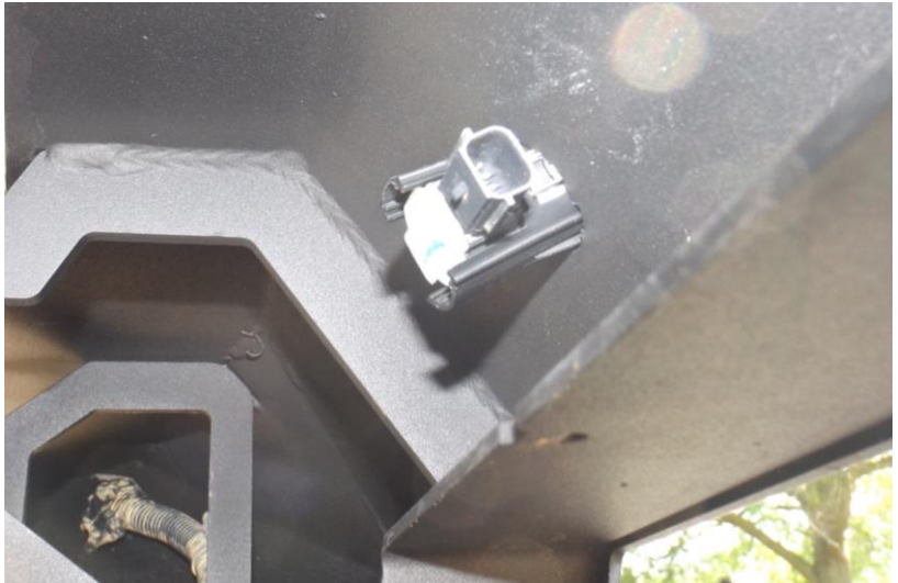
Figure 9A Inner DS Sensor Orientation

Product Number: D3051, D3052 Application: 2014-2015 Chevy 1500