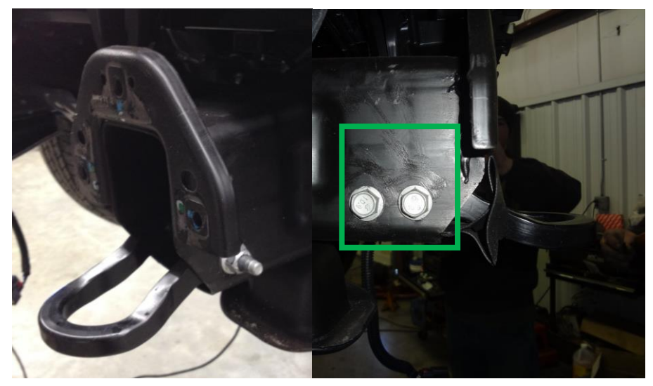
Figure 6a Figure 6b

G. Remove bolts securing tow hooks to frame. Location is indicated in image below by green rectangle (Ref. 6b).