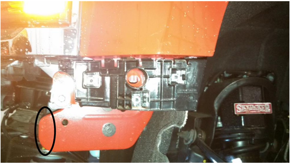
Figure 7a (AREA TO BEND INWARD)

H. Under the headlight bend the end of the mounting flange inward slightly, where indicated by circle.