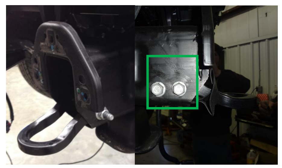
Figure 4a Figure 4b

D. Remove bolts securing tow hooks to frame. Location is indicated in image below by green rectangle (Ref. 4b).