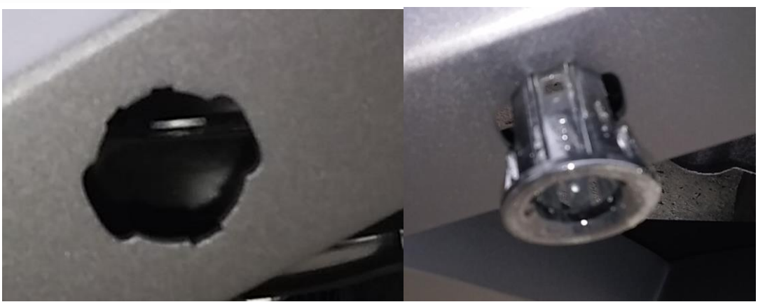
Figure 6C Outer Sensor