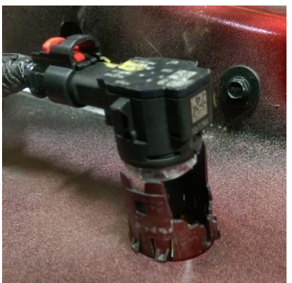
Figure 9 Figure 10

9. Remove the sensor housing from the bumper by depressing the four (4) tabs while pulling outward from the outside of the bumper. ( Figure 11-11.1 )