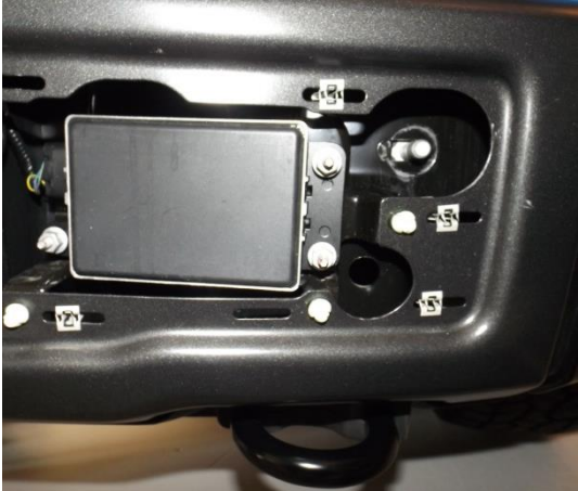
Figure 2a Figure 2b