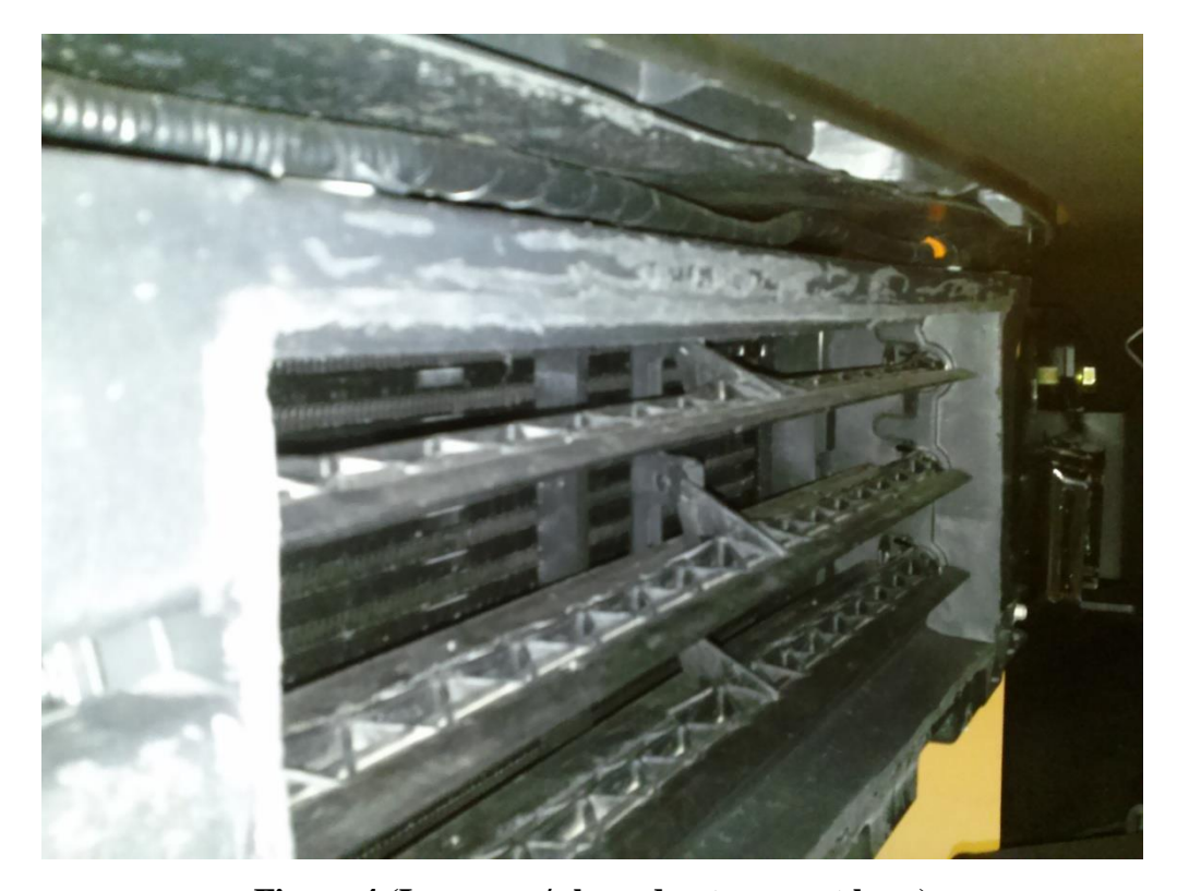
Figure 4 (Louver w/ shroud cut away at base)

G. If your vehicle model includes a louver system for the intercooler located between the frame mounts, the shroud must be removed. Special care must be taken not to damage louvers when cutting around the base of the rectangular shroud, a cut off wheel is recommended.