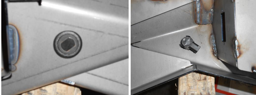
Figure 4e (inners passenger side)