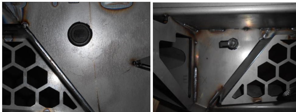
Figure 4c (Outer drivers side)