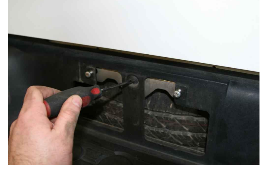
E. Pop the plastic clips loose on the bottom side of the main piece of plastic on the top side of the bumper allowing access to the OEM fasteners.

D. Remove the Phillips head screw passing through the plastic that was hidden by the license plate previously.