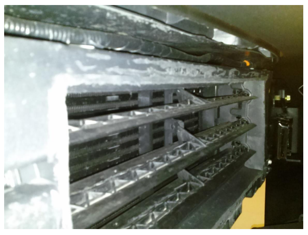
Figure 4 (Louver w/ shroud cut away at base)

<u>be taken not to damage louvers when cutting around the base</u> of the rectangular shroud, a cut off wheel is recommended.