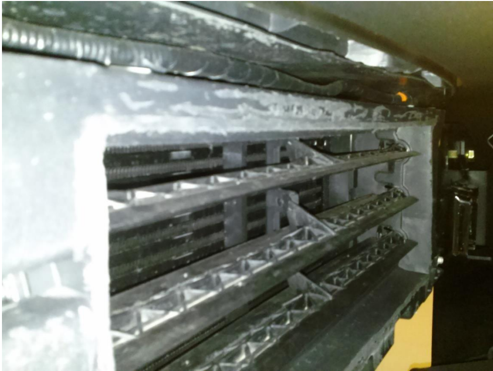
Figure 4 (Louver w/ shroud cut away at base)