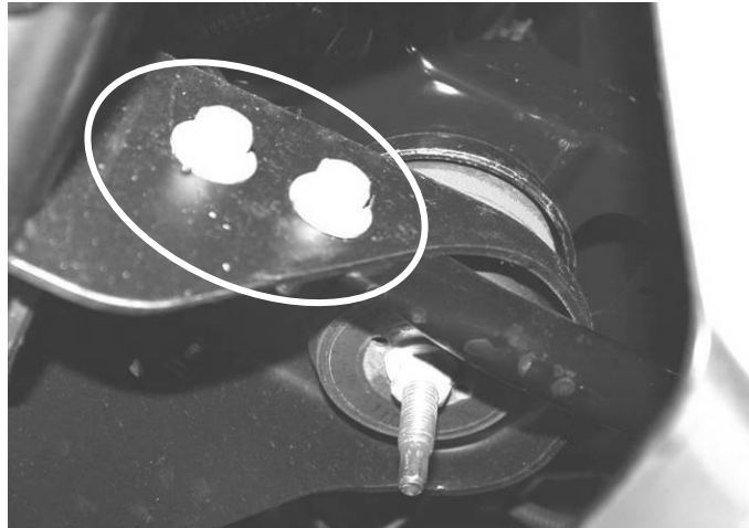
Figure 4 – Outer Bumper Support Screws