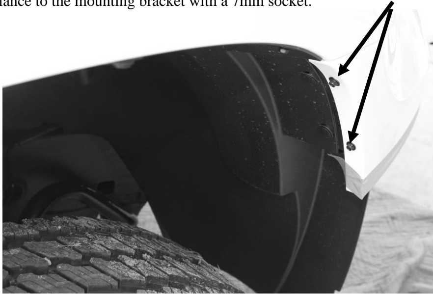
Figure 2 - Screw locations