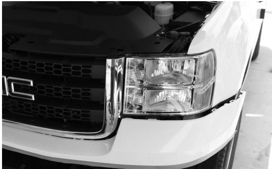
Figure 3 - Valance Removal