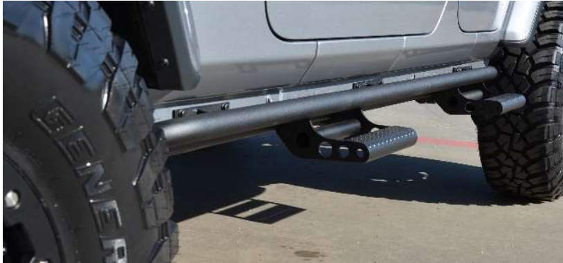
(Shown with optional Part# JPT32 detachable steps)