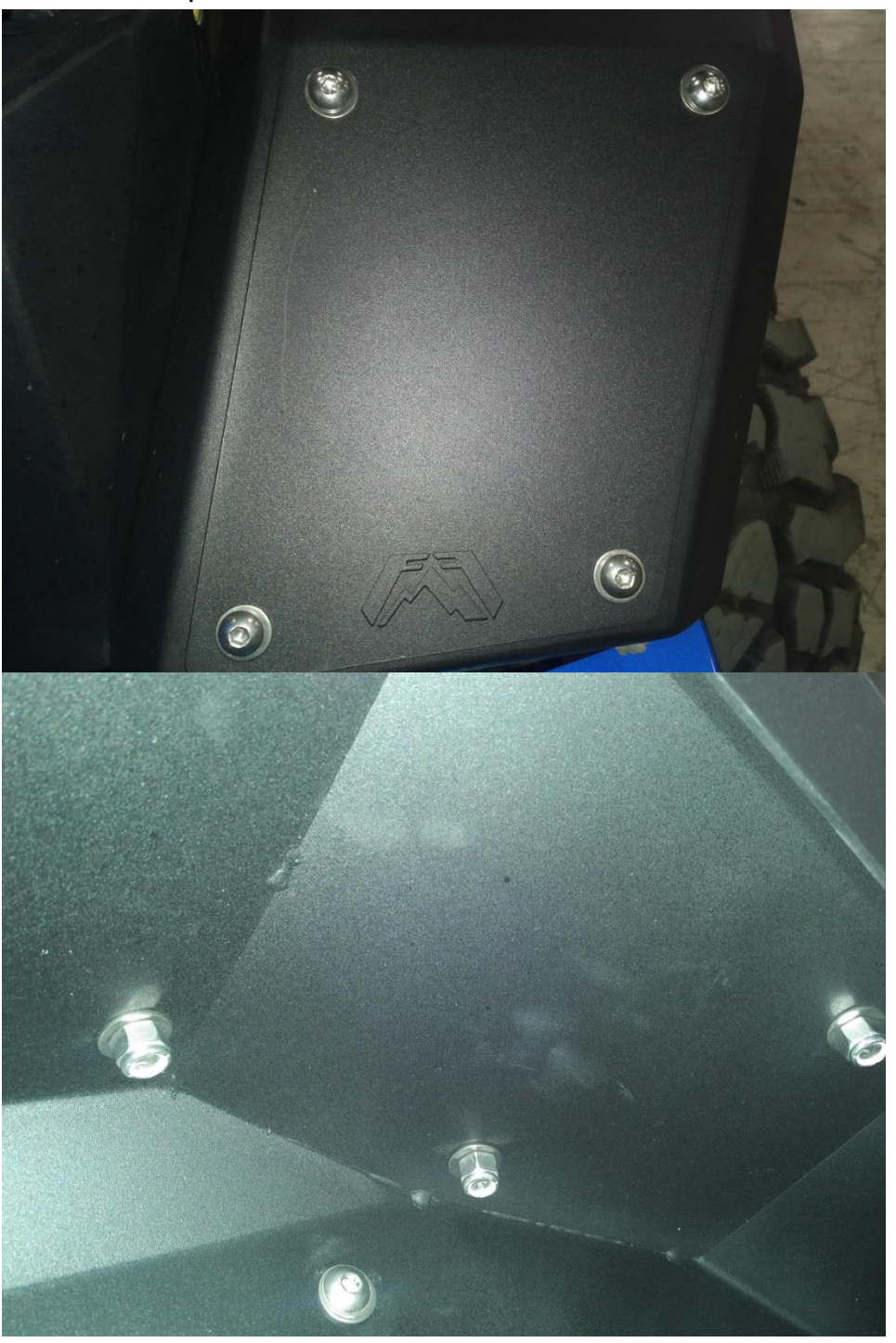
10. Your fender flares are now properly installed!

9. Install top cover plates using includes 3/8" hardware to the top of the fender flairs