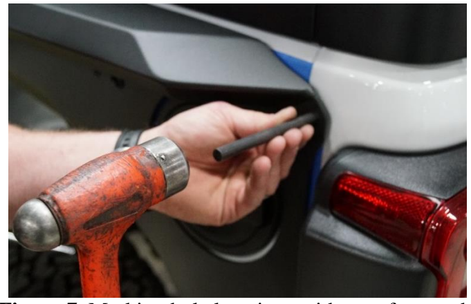
Figure 7. Marking hole locations with transfer punch.

6. With fender base held in place, using a transfer punch, mark the center of the mounting holes. Once holes are marked, remove fender base.