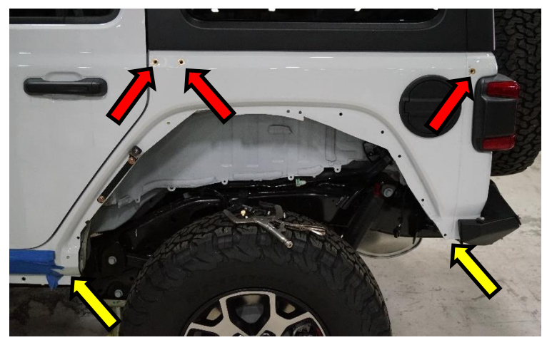
Figure 8. All rivet nuts installed and holes drilled. Red arrows indicate holes to drill out to 17/32"; yellow arrows indicate holes to drill out to 3/8".