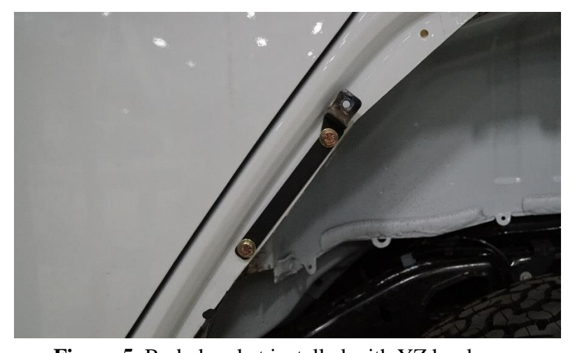
Figure 5. Body bracket installed with YZ hardware.