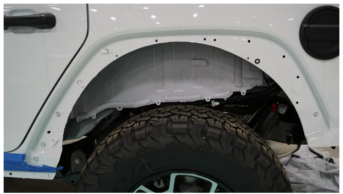
Figure 2. Remove white plastic clips that were left behind by OEM flare removal.