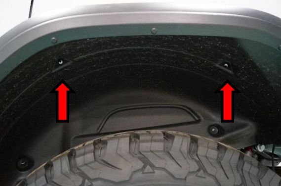
Figure 1a & 1b. Location of plastic clips to be removed.