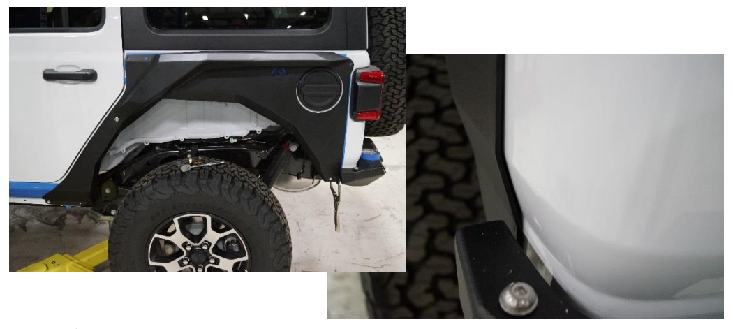
Figure 6a & 6b. Initial placement of fender for marking mounting points correctly.

6. With fender base held in place, using a transfer punch, mark the center of the mounting holes. Once holes are marked, remove fender base.