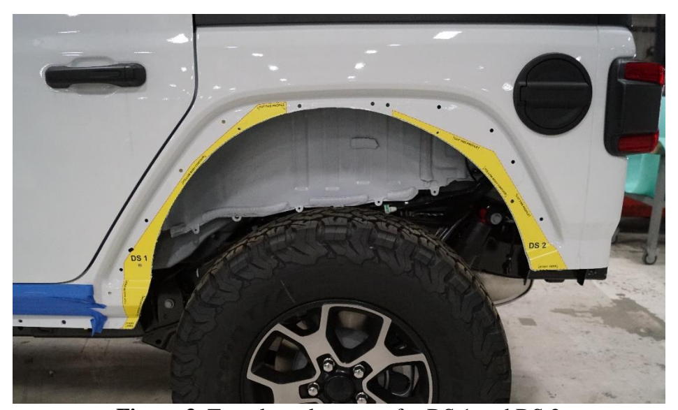
Figure 3. Template placement for DS 1 and DS 2