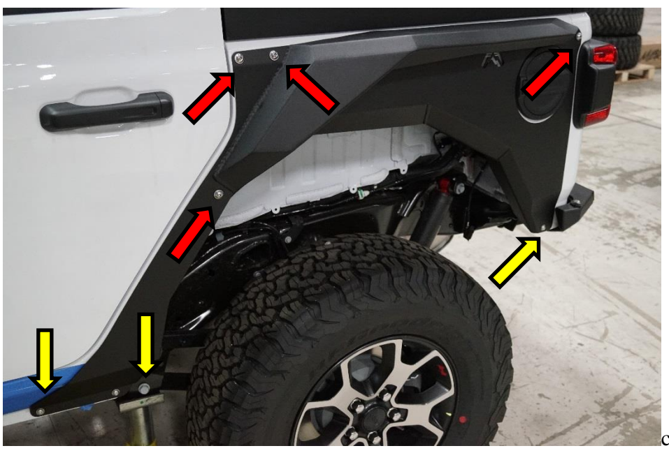
Figure 9. Locations for 3/8" SS hardware (red arrows) and 5/16" SS hardware (yellow arrows).

Repeat steps 1 through 10 to install other side.