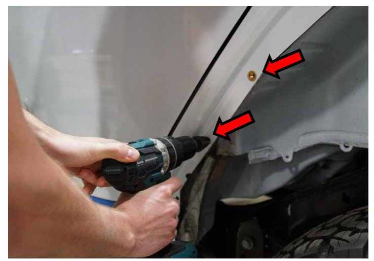
Figure 4. Drilling OEM holes wider to accommodate rivet nuts.

1. Start by drilling out the existing OEM holes (shown below) using the 17/32" drill bit included in the hardware kit. Step up to this size with smaller drill bits and/or use a step bit.