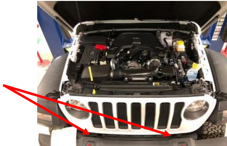
Figure 1: Top side of bumper