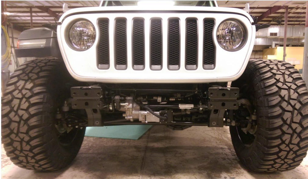
Figure 3: Bumper removed