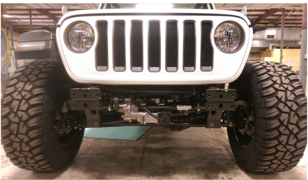
Figure 3: Bumper removed

□ H) Using Torx bits, remove the shroud and tow hooks from the factory bumper. The tow hooks will be reused in the Vengeance bumper.