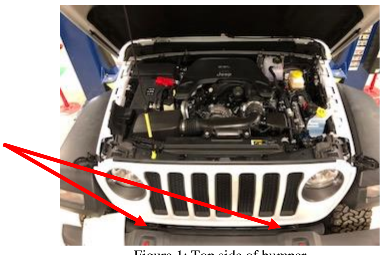
Figure 1: Top side of bumper

A ) Remove (2) dart clips from back side of plastic skid plate.