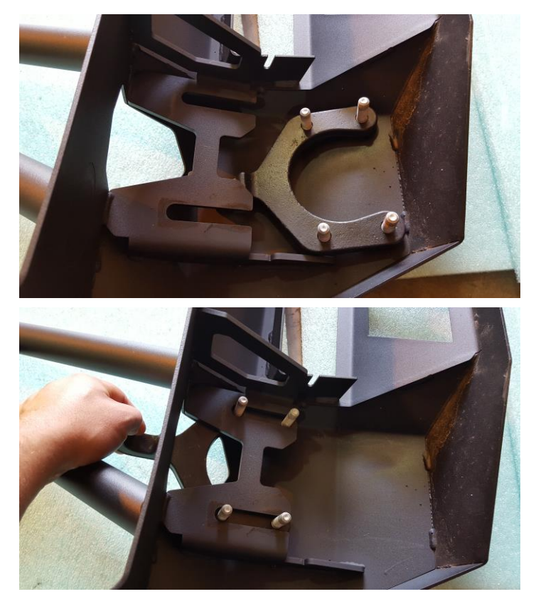
Figure 4: Installing OEM tow hooks

A ) Insert factory tow hooks into the vengeance bumper.