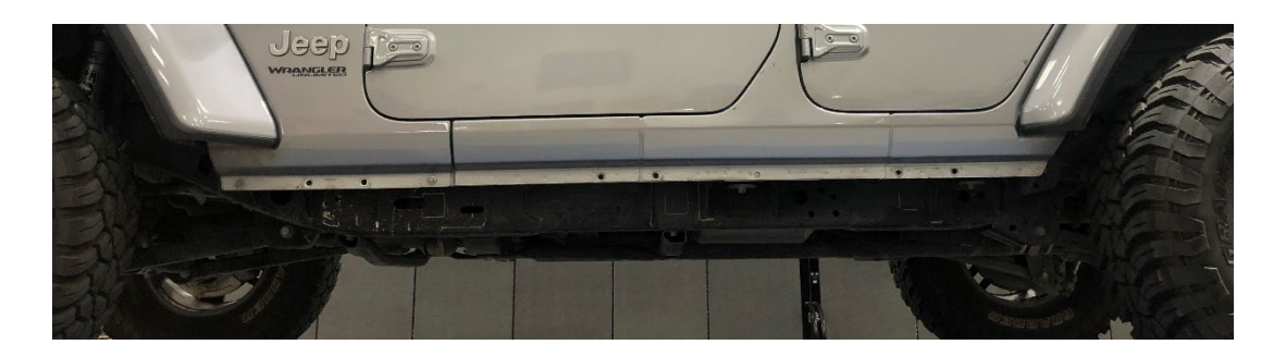
<u>Step 3.</u> With an assistant or use of jack stands, install the slider using the supplied M8x30mm hex bolt (x4) to the upper threaded mounts first and loosely tighten for now.