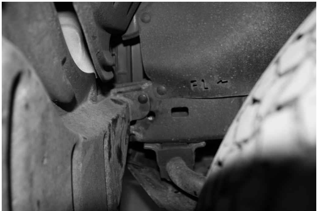
Figure 1 – Dart Clip Locations

1. Remove Dart Clip from front inner fender lining from frame. Complete both sides. See Image Below.