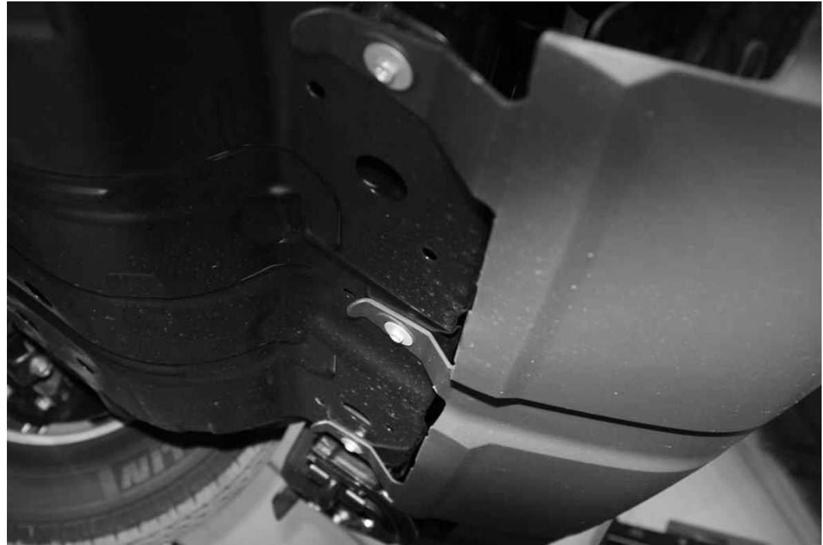
Figure 2 - Screw Locations

2. Using a Phillips Head screwdriver remove the three screws from the bottom plastic on the bumper. See Image Below.