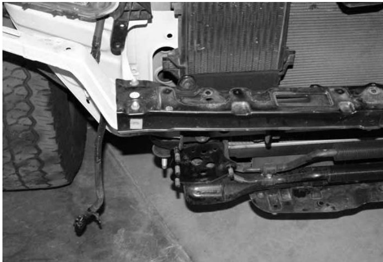
Figure 3 - Factory Bumper Connection

6. Using a deep 14mm socket and breaker bar, loosen the 4 14mm nuts located at the connection between the factory frame end and the bumper. See Image Below.