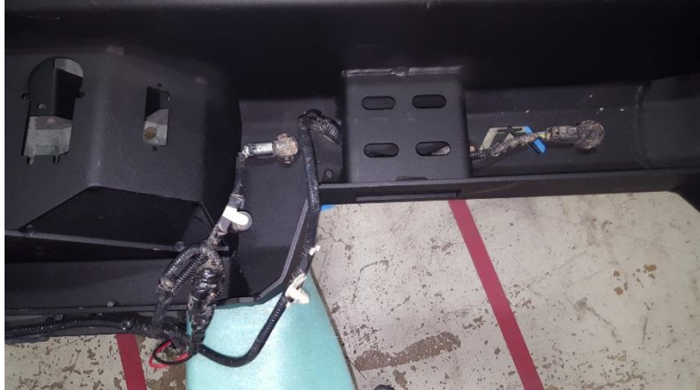
Drivers side sensor harness orientation. Passenger side is mirrored.

2. Sensor housings should be epoxied only AFTER testing to ensure that they still work.